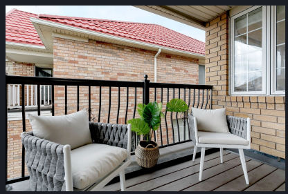
FOR MORE INFORMATION CALL